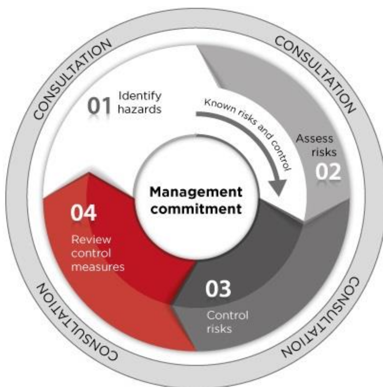
Figure 1 The risk management process

Further information is available in the Interpretive Guideline: The meaning of 'reasonably practicable' . The process of managing risk described in this Code will help you decide what is reasonably practicable in particular situations so that you can meet your duty of care under the WHS laws.