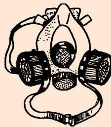
Half-face particulate filter (cartridge) respirator

*Your hardware store can supply all of the materials and equipment you will need.