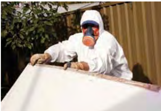
Fully licensed asbestos contractor removing the asbestos-containing underlay to vinyl sheet floors

For a list of organisations that can perform asbestos tests and inspections, refer to the 'OHS/Asbestos' pages at www.safework.sa.gov.au or consult the 'Yellow Pages' under asbestos. The 'HELP AND ADVICE' section at the end of this publication also provides useful contact details and resources.