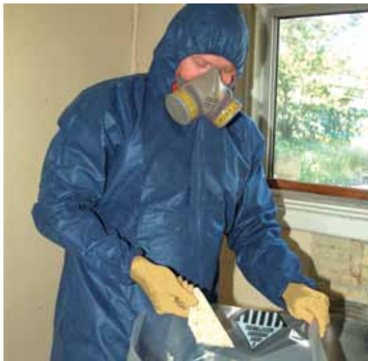
Cleaning up and safe disposal

*Your hardware store can supply all of the materials and equipment you will need.